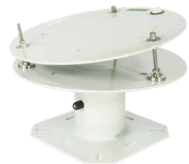
Universal Mounting Bracket